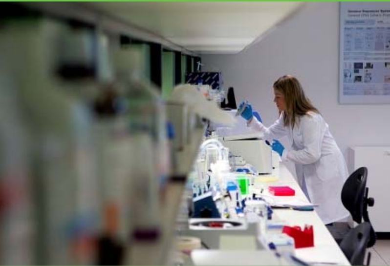
Genetics & Genomic Laboratory